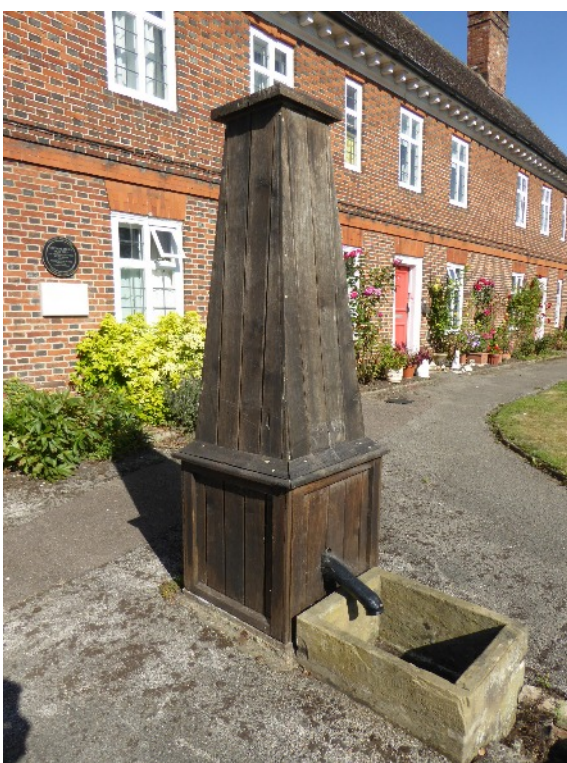
The Enclosed Pump, Mills Almshouses 2020