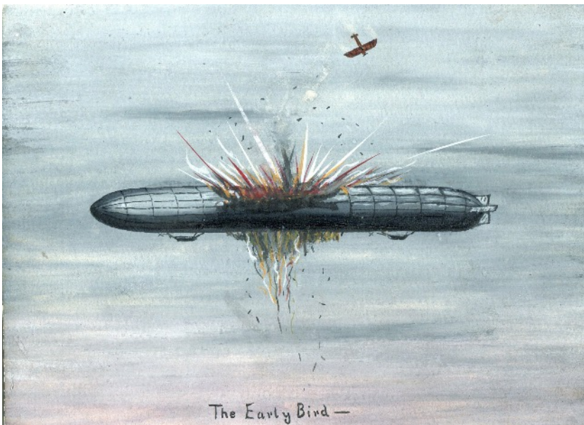
A picture by Harold Lanman of a successful attack on a Zeppelin, June 7, 1915

[Further investigation indicates this was the Zeppelin L10 which had its first flight on May 15, 1915 and would go on to make five raids on England. On 12 August, there was to be a four Zeppelin raid, but three turned back and it was only L10 that reached our shores. Bombs were dropped in our area, with reference to Badingham, Gelham Hall, Wickham Market, Melton and Woodbridge when men of the London Infantry Brigade engaged L10 with machine gun and rifle fire. That night, six people lost their lives when 24 bombs were dropped on Woodbridge, and 100 houses damaged or destroyed. The L10 then proceeded to Parkeston where further bombs were dropped. The Zeppelin L10 later carried out further raids, but did meet its end on 3 September when it was struck by lightning and destroyed in a thunderstorm near Cuxhaven. Cooper does refer to Eckener's book for his information on the L10's demise, so it is presently unclear why these details do not fully align. Visit www.iancastlezeppelin.co.uk for more information.]