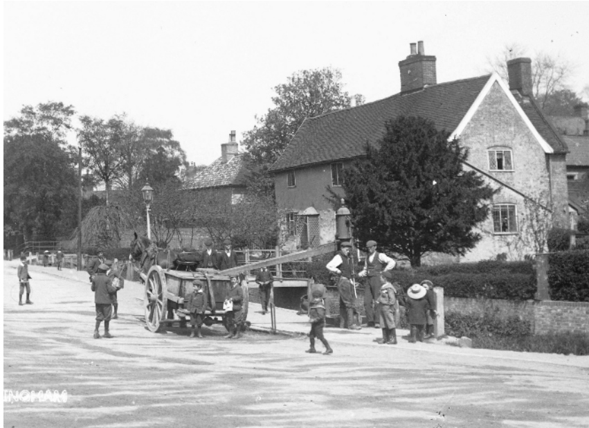
The Spring Pump, Riverside.